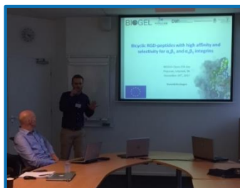
Pepsican, 20 th December