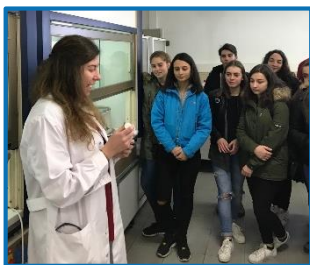
CERTH, 14 th February and 6 th March

As part of the communication and public engagement strategy of BIOGEL, the participants opened their doors to students and the general public during an ITN OPEN DAY. Visitors received presentations and tours in the research institutions and laboratories and participated in hand-on workshops. Below you find some impressions from the ITN open days that the different BIOGEL partners organized.