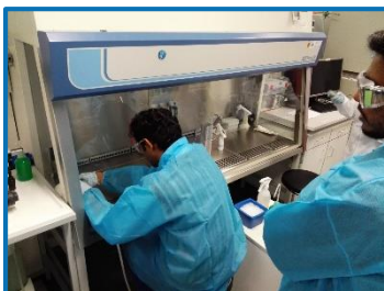
DWI, 21 st September