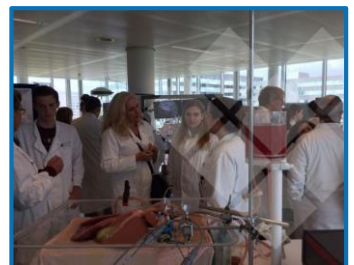
LTG, 8 th October